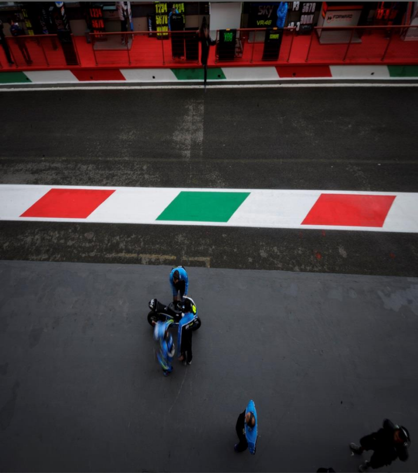
Pit Lane View